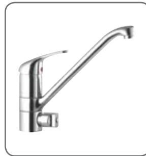
MODO LPDV CHROME

Product Code: 095191004 Bar Code: 520 1217 16816 2