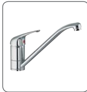
MODO LP CHROME

pressure; hence the name of these 'Low-Pressure' taps. The result is that the boiler is protected and becomes pressureless and the tap itself protects it from further water pressure in the house (3-4 bar). The hot water hose must never be closed in these circumstances.